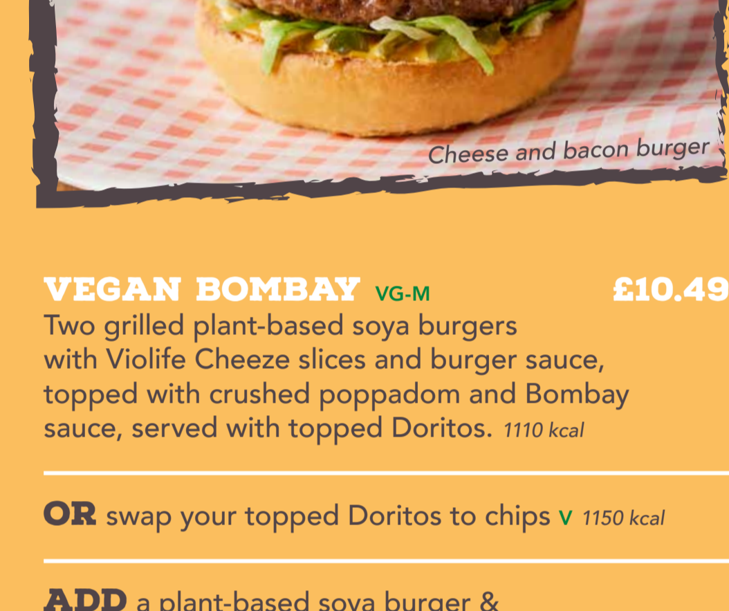
Cheese and bacon burger

ADD a coated chicken burger & burger cheese slice +£2.49 +231 kcal